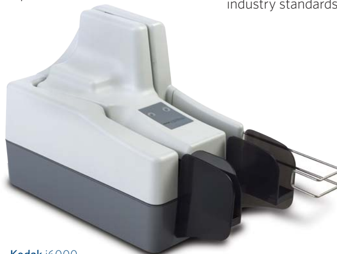
Kodak i6000 series check scanners