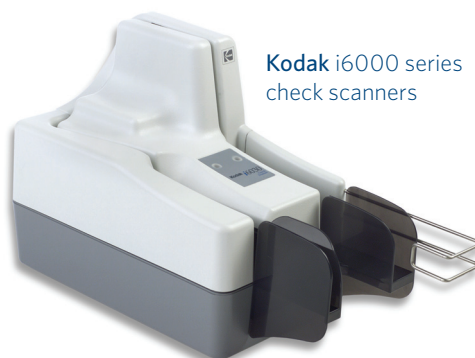
Kodak i6000 series check scanners