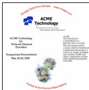
Disc 1 - 25%

The results from the second print test completed on the Rimage 480i were equally as impressive. The second test used Disc 1 , again with one set of standard ink cartridges for the Rimage 480i (one 17 ml RC1 cartridge and one 19 ml RB1 cartridge). With the Premium/Best print mode and setting; we were able to produce 1950 discs of consistent, high quality before the RB1 black ink cartridge ran out. That equates to less than 6 cents of ink cost per disc based on standard MSRP pricing!