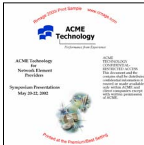
Sample A - Partial Coverage

* For internal use only, not to be distributed