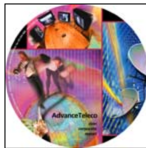
Disc 3 - 100%