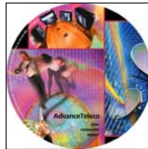
Sample B - Full Coverage