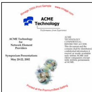
Disc 1 - 25%

We used labels that provided 25, 50 and 100 percent disk coverage with varying degrees of color usage to represent a typical end-user mix. If the print mode settings are changed to the highest possible setting of Photo/Maximum DPI , using the same 3 label set, we were able to produce 355 discs of consistent, high quality (119 copies of each disc).