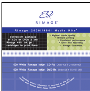
Disc 2 - 50%