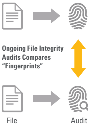
Figure 2: Unique fingerprint enables recurring checks for corrupted files.