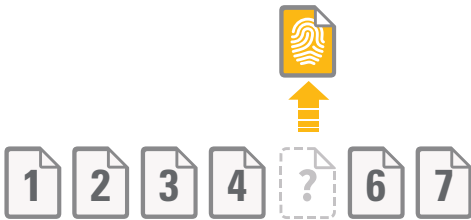
Figure 1: Assureon’s unique file serial numbers enable easy identification of missing files.