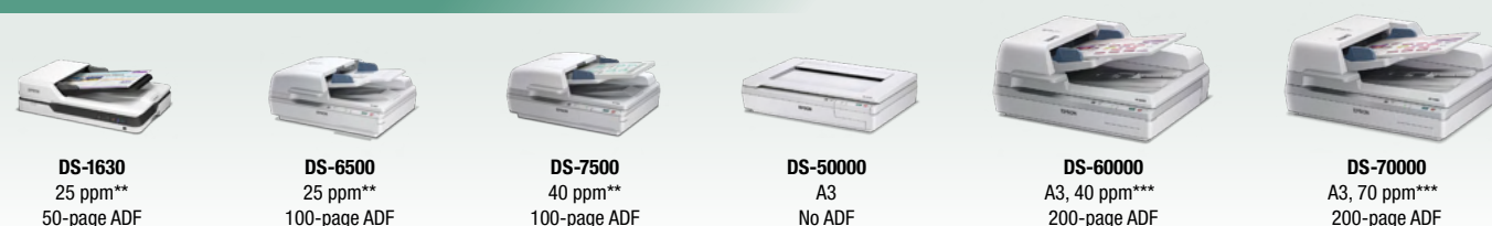
DS-1630 25 ppm** 50-page ADF