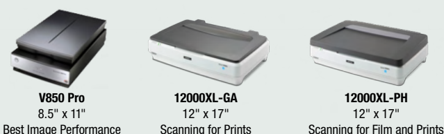
V850 Pro 8.5" x 11" Best Image Performance