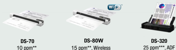
DS-70 10 ppm**