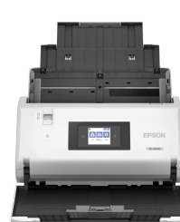
A3 Workgroup Scanners