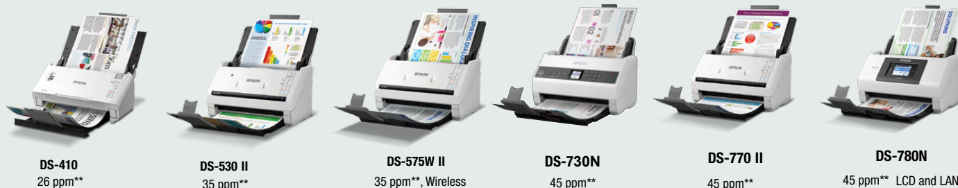
DS-410 26 ppm**