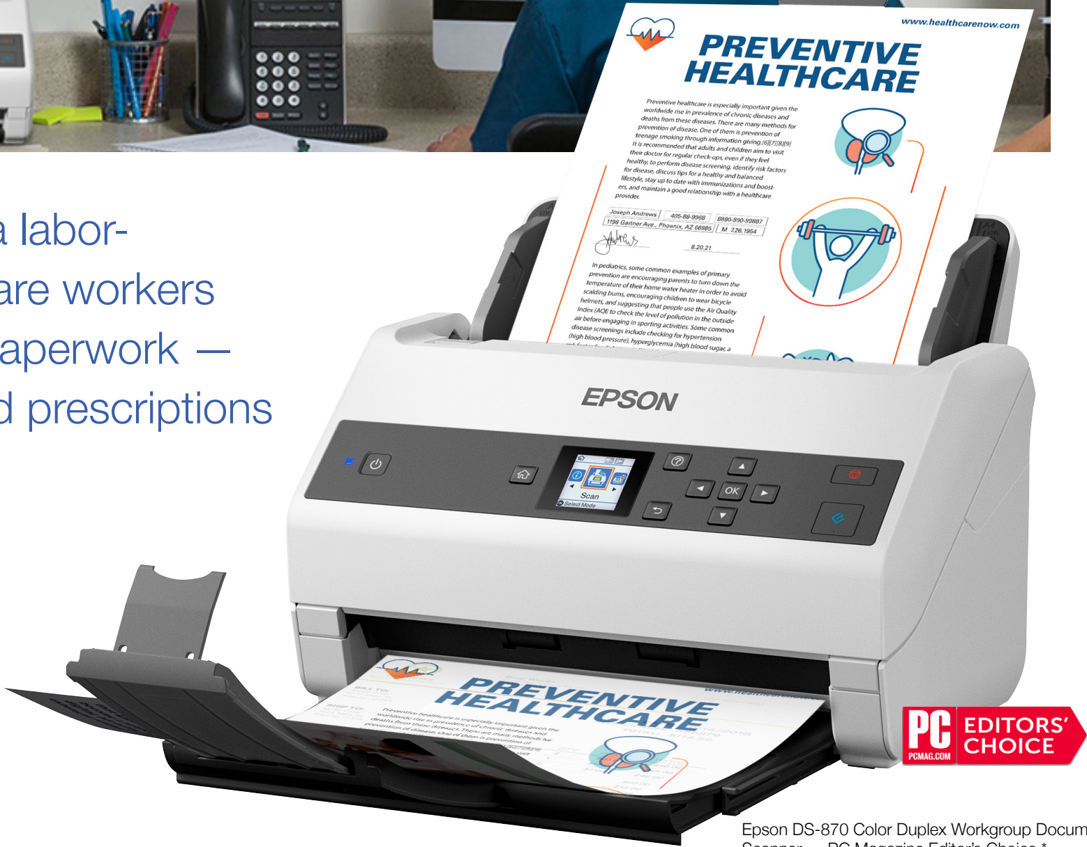
Epson DS-870 Color Duplex Workgroup Document Scanner — PC Magazine Editor's Choice.*

Choosing the best document scanner for your practice is a crucial step for healthcare workflow efficiency.